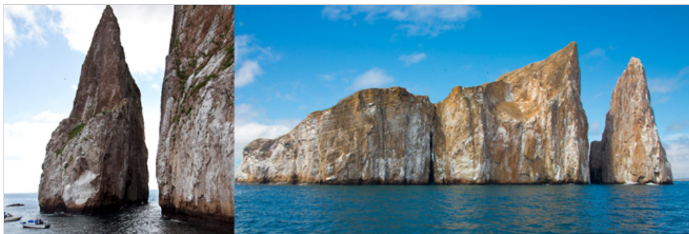
Kicker Rock, San Cristobal Island

This striking rock formation is located a couple hours off the western shore of San Cristobal. Jutting out of the water, the rocks stand vertically at hundreds of feet above the ocean divided by a small channel. Although there are no landing areas, circumnavigation allow visitors to spot a variety of marine life.