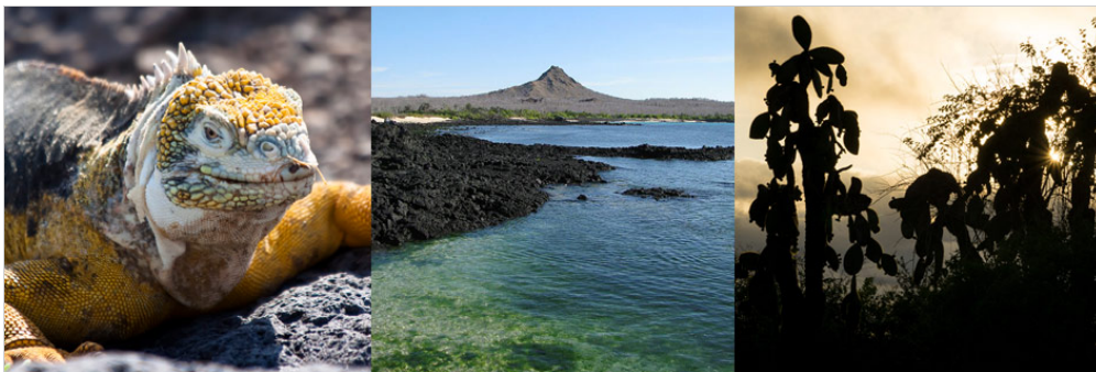
Dragon Hill, Santa Cruz Island

Situated on Santa Cruz Island, Dragon Hill is one of the newest visitor sites accessible to tourists in the Galapagos Islands. One of the lengthier Galapagos walking trails will lead visitors along a beach and up a trail to the lagoon lookout where bright flamingos, pintail ducks, and land iguanas can be spotted.